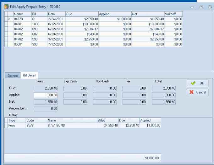
Cash receipt processing functions are completed in one location with an intuitive interface.